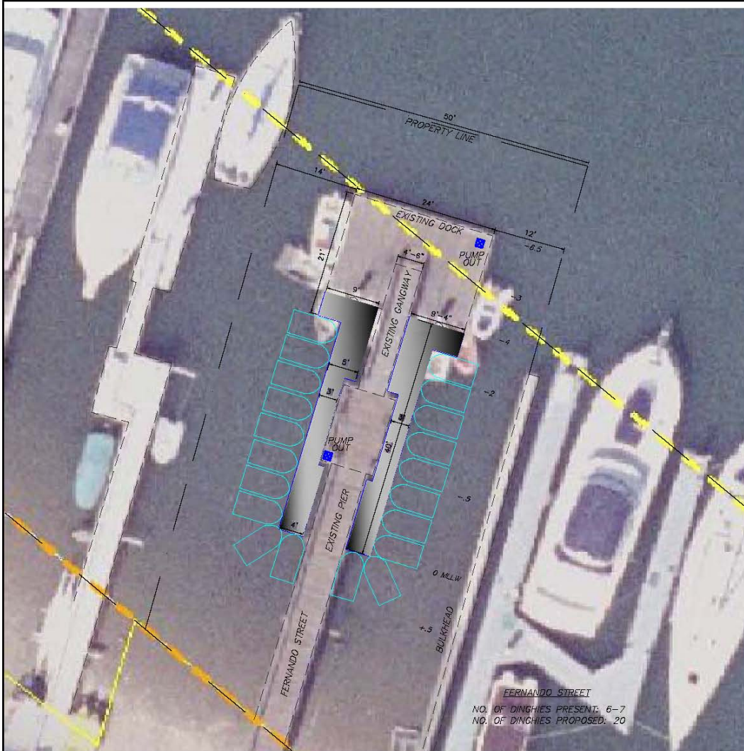
EXHIBIT 4A: FERNANDO STREET